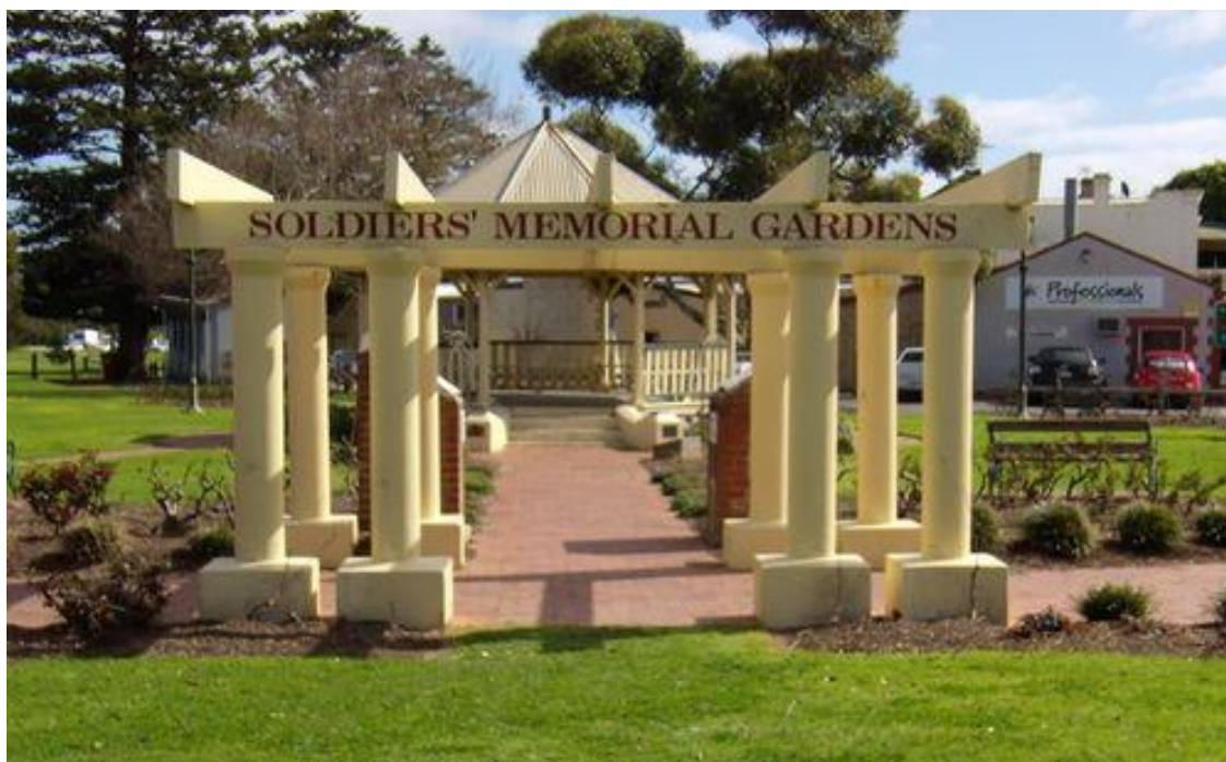
Soldiers Memorial Gardens (above) & Goolwa Honour Roll for the Fallen (below)