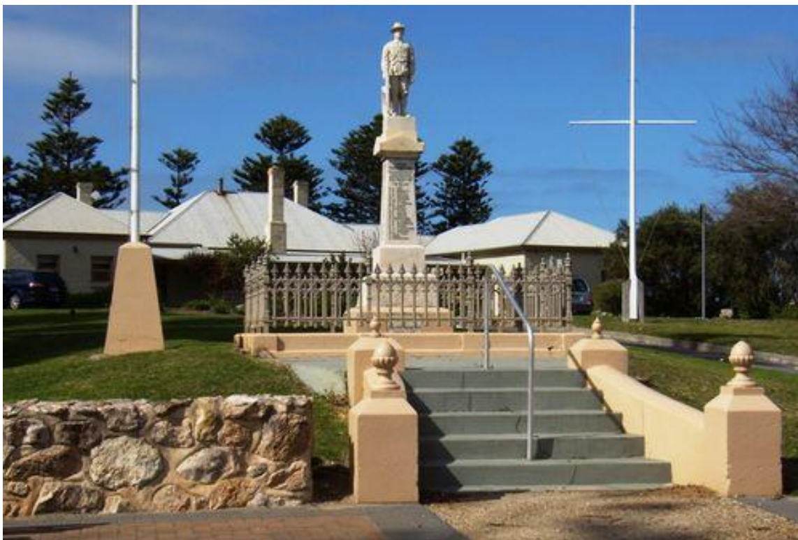
Goolwa Soldiers Memorial