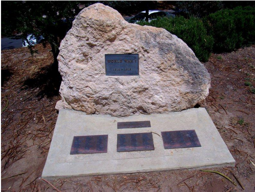
Goolwa RSL World War One Honour Roll